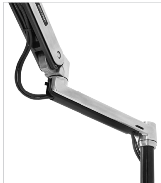
CABLE MANAGEMENT CLIPS ON THE UNDER SIDE OF THE ARM ROUTE AND HIDE CORDS

DESK CLAMP ATTACHES TO EDGE UP TO 2.5" (65 MM) THICK